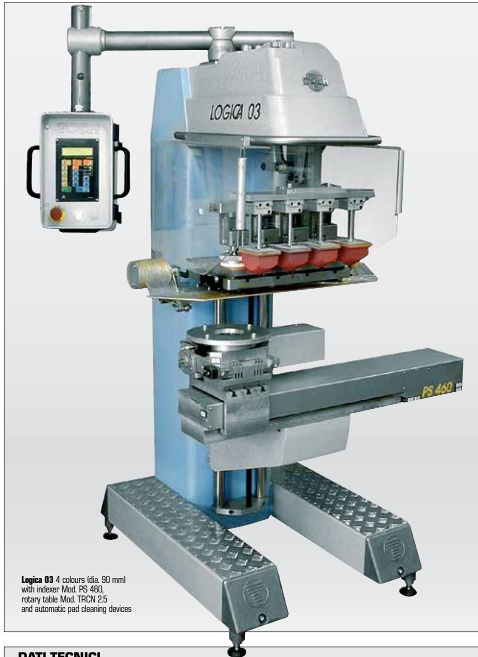
Logica 03 4 colours (dia. 90 mm) with indexer Mod. PS 460, rotary table Mod. TRCN 2.5 and automatic pad cleaning devices